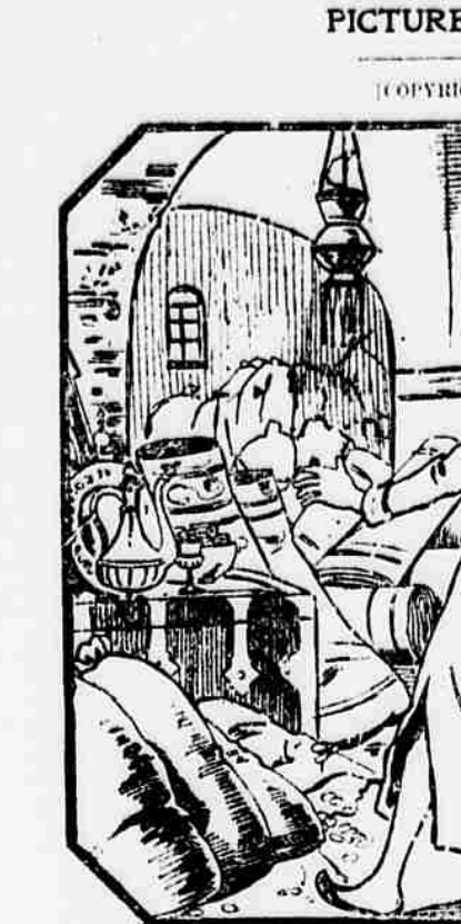
All Baba in the Robbers' Cave. Find Cassim and his wife.