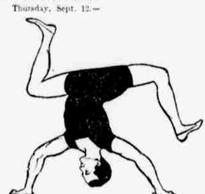
Which proverb does this picture represent?

Monday, Sept. 9.—Farmer Jorkin's face is on man's coat on the left, one pig is between the man and woman, the other on toaster's tail, and the goat is between the two inside men's heads.