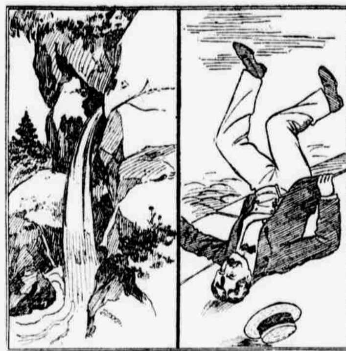
What two seasons are represented by this picture?