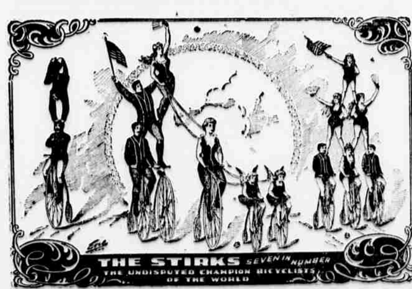
The Up-to-Date Highest Class Circus in the World

It Produces Everything Advertised, and Does Not Deceive.