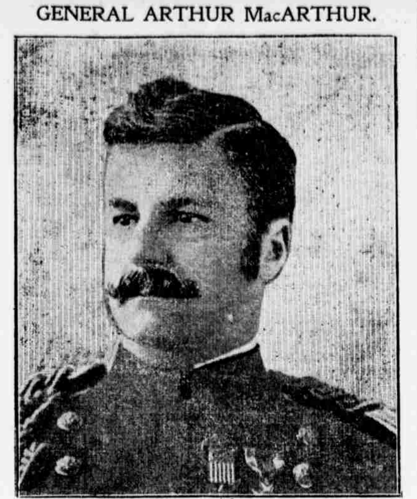
This portrait of General Arthur MacArthur, who has succeeded General Otis in command of the American forces in the Philippines, is from the last photograph of him taken before his departure for the islands.

EVERETT'S LIVERY. 236 Dix Court. (Near City Hall.)