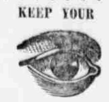
On Our Windows

They Are Selling Fast! These Spring Top Coats. The people of Scranton read, mark and learn, that we are leaders. This is not a half price sale of Overcoats, but it is a moderate price sale of the best manufactured Top Coat to be found in the land of qualities, which will compare more than favorably with those turned out by the best merchant tailors, and our prices are certainly less than half. Look at these two in our show window.