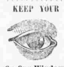
On Our Windows