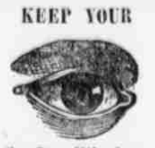
On Our Windows