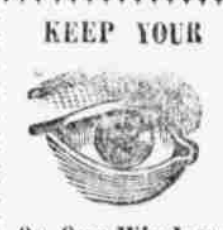
On Our Windows