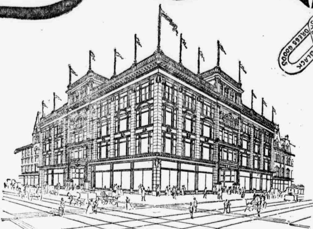
SCRANTON ESTABLISHED 1897.