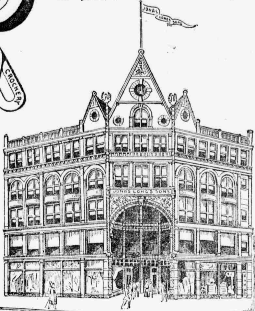
WILKES-BARRE ESTABLISHED 1860.