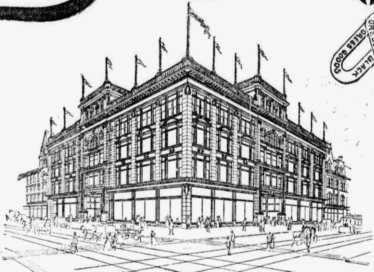
SCRANTON ESTABLISHED 1897.