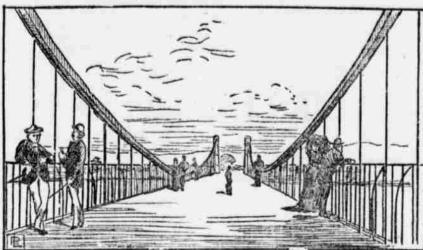
SUSPENSION BRIDGE, LLANDOVERY.