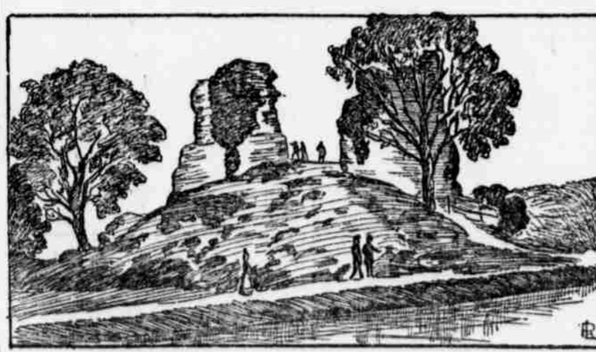
THE OLD GASTLE, LLANDOVERY.