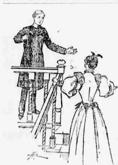
HE COULD HARDLY KEEP THE TEARS BACK.

Then uncle almost choked. "A lot of tommyrot about an experiment that