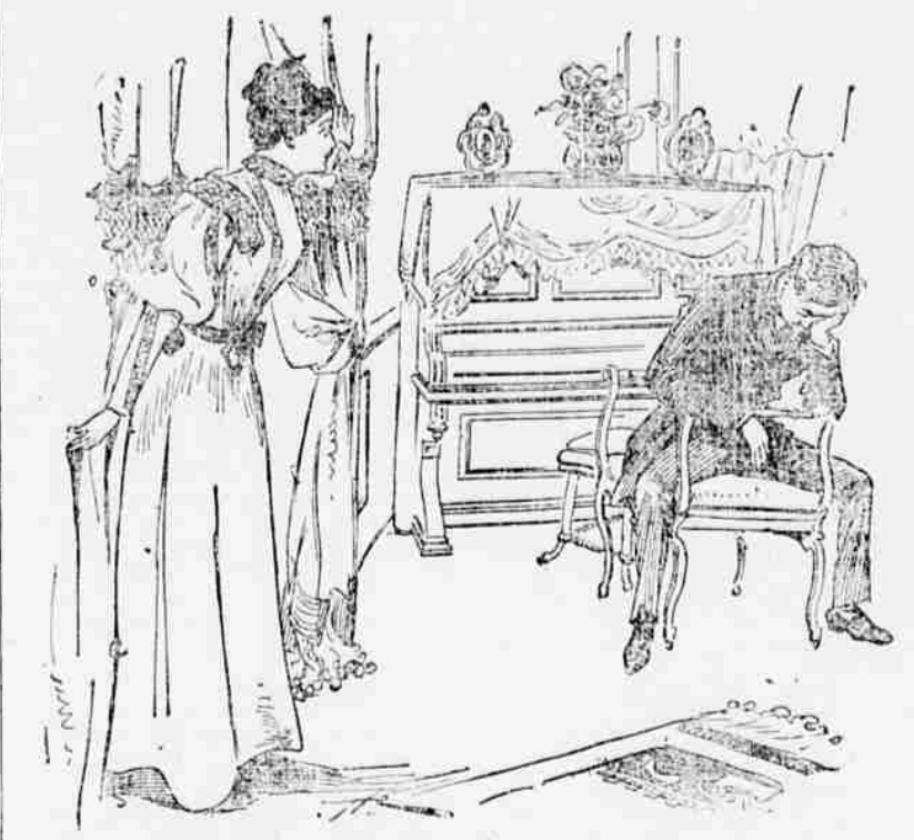
HE LOOKED FOR ALL THE WORLD LIKE A DISCOURAGED BAT.

you to be good to me, and let me have the exact position of the line D3, and chould indicate the presence of helium, He had been storming about the But my specimen is hardly large