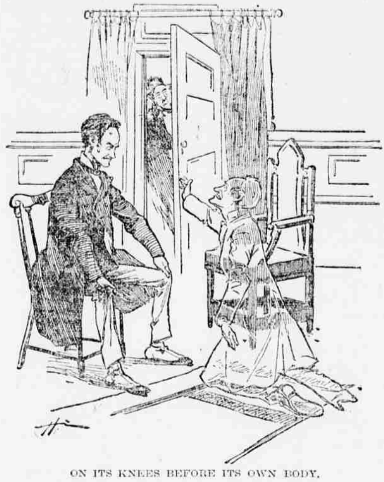
ON ITS KNEES BEFORE ITS OWN BODY.

"I tell you, squire," said the spirit, "it's a low trick you have played me. I came after you to bring you back to your friends and to the old home where you have been contented and happy for so long, and where you would be well looked after and cared for, for the rest of your days, and there you go and re-bay me by robbing me of my poor body that never did you any harm in its life."