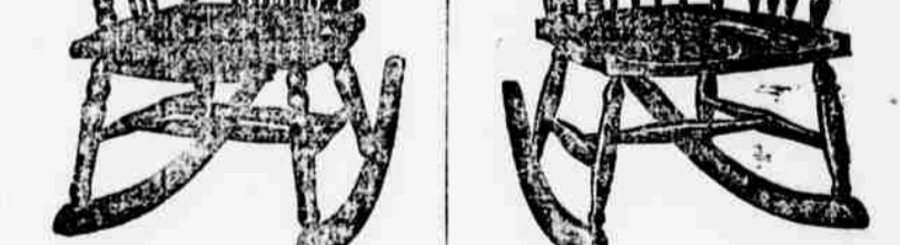
This colder seat, solid oak, or mahogany finish Rocker, worth $3.75, now $2.29 price. A favorite high back, polished saddle, wood seat rocker, worth $3.00, we sell $1.49

A lady take a $1, $2 or $5 bill and deliberately throw it into the fire, what would you say about it? You'd say "extravagance" or "wastefulness" or "something at any rate you'd think so after looking over the following values we have to offer