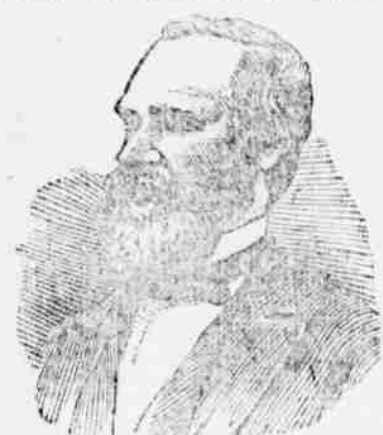
GALUSHA A. GROW.

Towards, Pa., Aug. 13.-The Republican convention of Bradford county met here today. Ex-Speaker and Congress man-at-Large Galusha A, Grow adcreased the convention at the close of