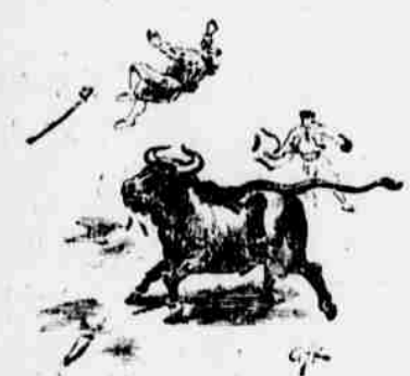
FLUNG A SHAPELESS HEAP ACROSS ITS ARENA.

the blood-stained sand within. The plebelan portion of the audience were wrought to a state of frenzy; even the fine ladies and gentlemen in the boxes threw aside their affectation of well-bred indifference, and, rising, leaned forward, waving their bandker-chiefs and fans. It was felt that some fatal accident must occur unless the