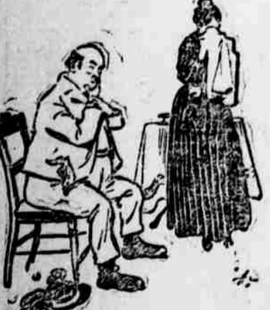
Master Simon remarked that she must be finding it lonely.

What disturbed the placid current of Master Simon's cogitations? Why this? he was the last of his race, and unmarried. For himself, he had no inclination to marry. But sometimes, as he shaved his chin of a morning, the reflection in his round mirror would suggest another. Was he neglecting a public duty? Now there dwelt down at Pontegos a Mistress Prudence Waddilove, a widow, who kept the Pandora's Box Inn on the quay—a very tidy business. Master