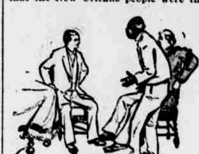
"Foh de Lawd, You Doan Spec' Me."