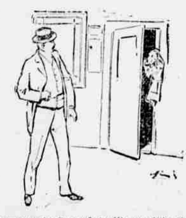
He Saw the Face of the Woman Who Had Followed Him.

It-porter he was. It's a fad of his, rolling up umbrellas close and neat, and he's rather proud of it. He often looks as though he'd like to take a