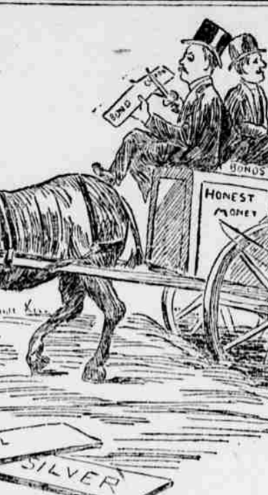
How Will It Get Out of the Bog?