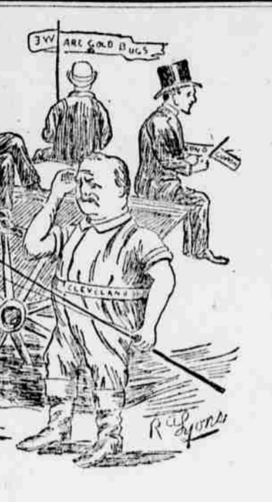
How Will It Get Out of the Bog?