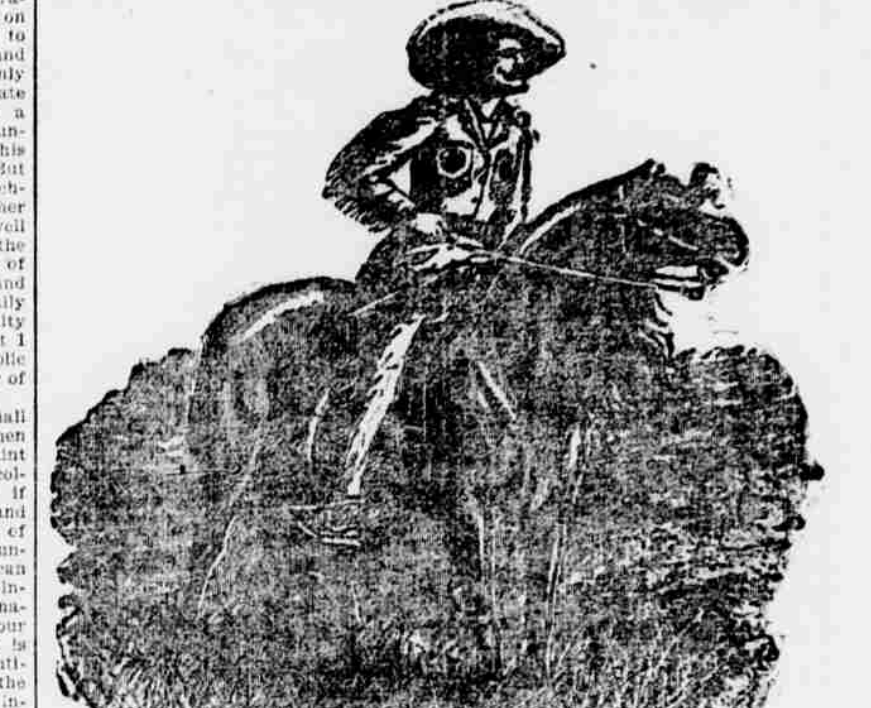
Dr. W. F. Carver, Evil Spirit of the Plains, Champion Shot of the World.

Probably there is no man better known in the shooting world than the famous Dr. W. F. Carver, who is better known as the 'Evil Spirit of the Plains.' Dr. Carver has been decorated by Emperors, Kings, Princes and the