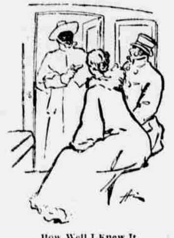
How Well I Knew It.

"Beauty," quoted the highwayman-'and I am sure the lady is beautiful-