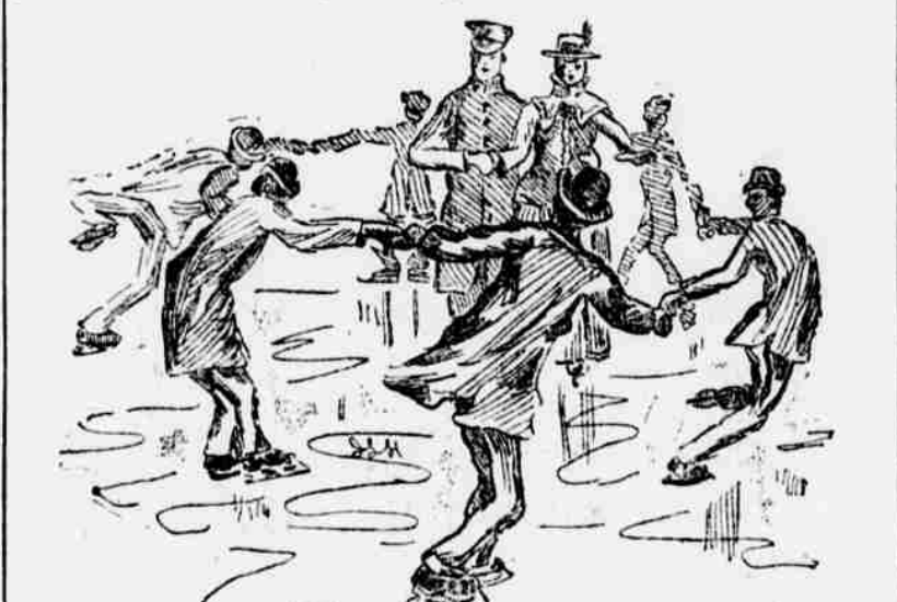
The Envy of His Fellows.

Children at the Rinks. At all of the skating resorts are nightly seen young girls not yet out of their teens, unaccompanied by escort or chaperons. They remain until al-