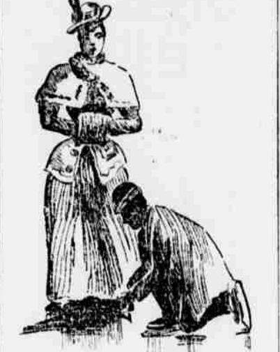
Skate Strap Becomes Loose.

The selfish skater is usually an expert and he gracefully sails about confident of his ability. The treacherous