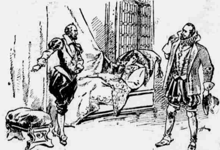
"Begone, Sir," He Said.

during which I had served him faithfully, and the omens I had incurred for his sake; and having by these means placed the discussion on a more equal footing, I descended again to particulars, and asked respectfully if I might know on whose authority Mme. de Verneuil was said to have the cipher.