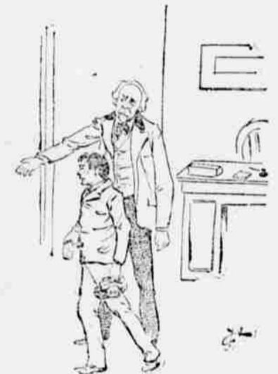
"Managed to Pick His Pocket for the Second Time."

"It was when I was a youngster," said he. "There was a big city man in those days who was known to have a very valuable gold watch. I followed him about for several days before I could get a chance; but when I did get one, you may be sure I did not throw it away. He found, to his disgust, when he got home that day, that there was nothing in his job. I hurried off with my prize, and got it stowed away in safety, intending to have it melted down next day. Now it happened that this watch possessed a special value in the owner's eyes because it was a sort of ancestral possession—presented by his father on coming of age, or something of that kind. I remember there was long inscription on the back. He was determined not to lose it if he could help it, and accordingly he put an advertisement in an evening paper offering thirty pounds reward for its return, and promising that no questions would be asked. He gave the address of his house, 31 Caroline square, at the end of the advertisement. The thing sounded good enough, so I off for Caroline square, leaving the watch in a parcel at a public house where I passed on the way. When I got there, the gentleman who at dinner, but he came out quick enough when he heard that a young man wanted to see him. I suppose he guessed who the young man