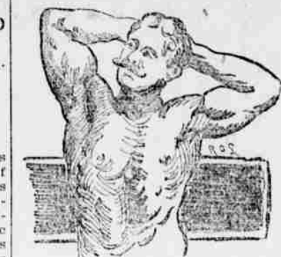
One Result of Physical Training

Scranton a number of clubs under th control and management of the gymna-sium, and which proved so successful that they will be continued next sum mer and probably indefinitely. There were established a pedestrian club, a photography club, camping parties, a