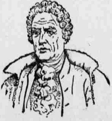
Goethe's Visit to Carlsbad.