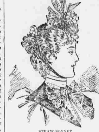
GLACE SILK COSTUME.

It is far easier to remodel a gown satisfactorily than to make over a hat for a second season's wear. The skirt of a costume may be sponged, newly faced and pressed and fresh material used for the sleeves and vest of the bodice, and the effect will be to make the gown almost as neat and new looking as it was in the first place, provided the stuff was good enough originally to be worth the trouble of making over. But a hat or bonnet must be fresh in order to be attractive. It is sometimes possible to retain a fine hat shape, and expensive