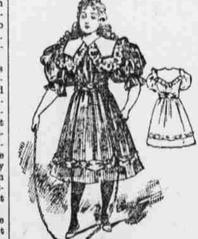
ACCORDION PLAITED GOWN.

How interesting it would be if we of the present day could see posterity—that posterity which could never be without us, but which will yet look back on us with wonder and pity not unmingled with contempt! If we could only have an idea approaching accuracy of its standards, say 500 years hence, perhaps we would be more patient with existing conditions, seeing in them a step toward that higher level. The most fashionable woman of today would, just as she has been, a miracle of learning and accomplishment 500 years ago, when the ability to read