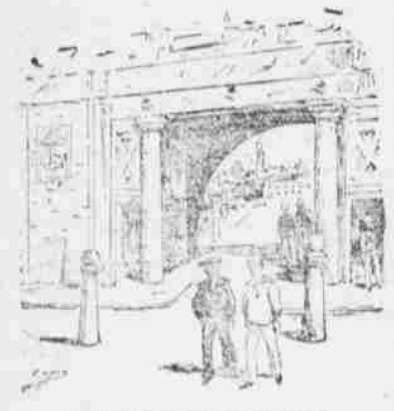
GATEWAY TO THE NAVY YARD.

Washington, July 8.—The navy yard is one of the most striking sights of Washington. The correspondent puts in a day there soon after his assignment here and as a rule never goes near it again. The average congressman visits it once for his own sake and occasionally thereafter to show it to visiting constituents. The visitors who really enjoy it are the tourists from the great interior, nine out of ten of whom never saw an ocean vessel in their lives or a cannon larger than the ordinary fiddlers which country towns utilize for the Fourth of July and other patriotic occasions. And how they do enjoy it! The lively and rolling ship and its neatly uniformed crews fill them with admiration. They swell with pride over the captured can-