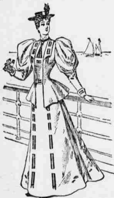
YACHTING GOWN WITH CLUB COLORS.

A pretty idea for decorating a gown with the yachting club colors consists of a coat and skirt threaded with rib-