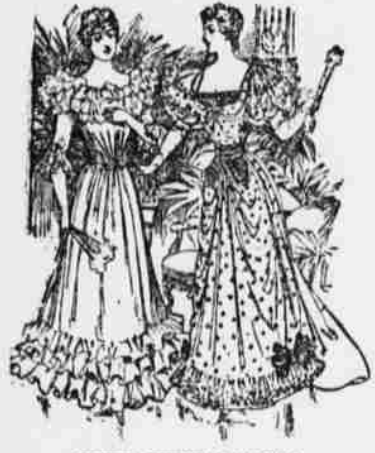
PRETTY EVENING GOWNS.

They are draped across, folded into the belt, arranged with rills, wide spreading collars and revers, elaborately trimmed with lace, chiffon and spangled trimming, but they are in appearance practically seamless.