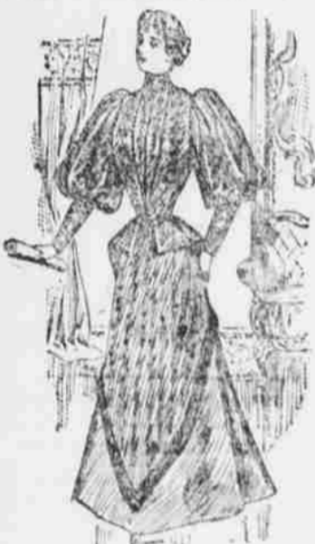
A MORNING COSTUME.

Great latitude is allowed this season. Hence women who desire to retain the clinging skirts may do so and without offense while her neighbor who is fond of drapery is wearing a gown with overskirt. Both are in the fashion. When it comes to the sleeves, there is, however, but one rule—these must be large. The variety in millinery is bewildering. There are tiny bonnets and toques without strings and large hats with and without strings. English walking hats with the brim turned up on both sides are of black straw, or of combined eoru and black, and when trimmed with black satin ribbon in a band and bows choux, with some short curling tips, are very stylish for wearing with tailor gowns. Close hats with cooled hair are partly of eoru leghorn and partly black. Soft padded crowns are on many hats. Sailor hats are worn quite plain of smooth black eoru or blue straw, with a high crown, narrow brim and only a band of ribbon with a bow. Other