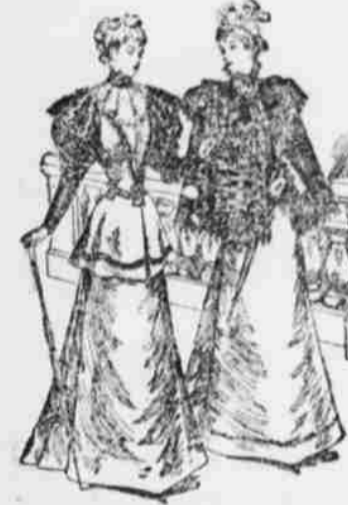
TWO WALKING COSTUMES.

Skirts are very wide, some having foundation skirts that are 4 yards wide at the foot. Some are straight in the back and others are in godet plait, while still others have an apron falling nearly straight between side panels and plaited at one or both sides at the top. There are also pointed aprons quite short in the back, and the pointed overskirt of last season is again seen. Very often, however, the overskirt or apron is merely outlined by two wide ribbons or lace or ruffles of the material drawn down from the back to point at the toe and accentuated there by large bows. There is a tendency to return to kilt plaited and box plaited skirts, finished at the top with a very short apron and long such ends made of a single breadth of the black moire, the apron curved up in folds from front to back, then down