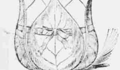
A TULIP FAVOR.

These are made by cutting a figure in shape like the diagram. The distance from the center to the tip of each petal