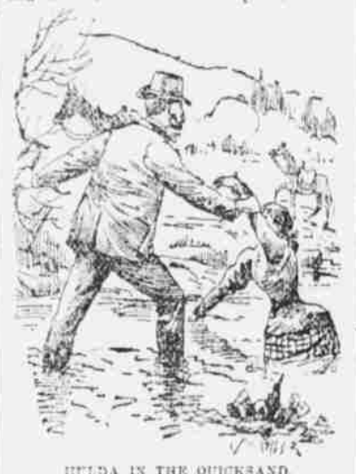
HULDA IN THE QUICKSAND.

the valley of San Bernardino of course he knew nothing about raising and marketing oranges, and as a consequence he was well on the road to grief by the time he had learned, and it was about this time that I, Jack Gillette, an old bachelor with more money than anything else except love for George and his youngsters, happened out his way and furnished him with sufficient funds to keep the wolf and the sheriff away from his door.