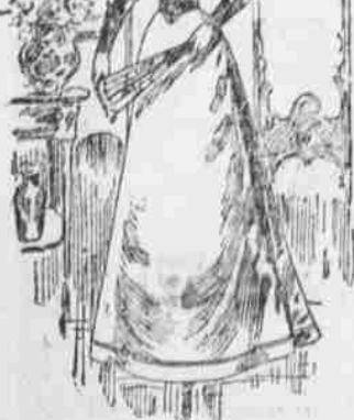
BECOMING TO SLIGHT FIGURES.

A New Bodice. A bodice quite new and also very becoming to slight figures may be made up in any of the wool materials for spring wear. It has a velvet yoke, belt,