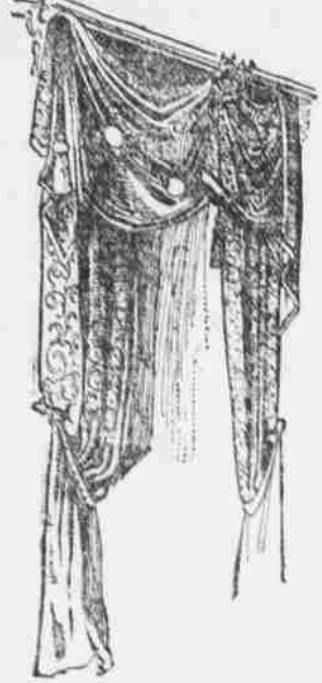
A PARIS DRAPERY.

The old fashioned lambrequin had its use, and a reminiscence of it is often seen across the curtain in some fanciful way. When the window is a bow, the silk is carried along all the windows from one pole to another, forming a continuous upper drapery. Decorator and Furnisher notes and illustrates this and some other new ideas in drapery as follows: This strip of silk is used in the case of windows