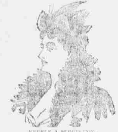
SURELY A SQUANDER.

"But it's Lent now, you know." Ah, yes; Lent is a name and a distinction. These things must be said, and these things not, runs the dialogue of the divines. They may not marry, nor hold a grand ball, or give more than a reasonable number of dinners.