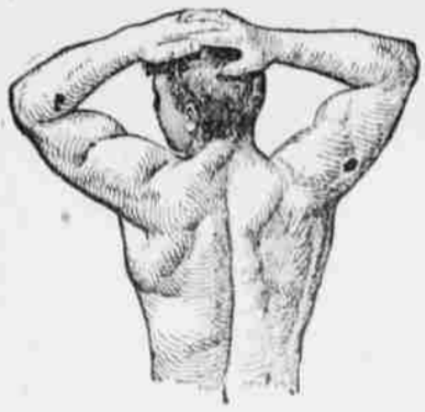
"FEEL LIKE A NEW MAN!"

So says everyone who has tried Paskola, the great flesh-forming food. Nothing equals it for building up sound, healthy flesh, enriching the blood and imparting new strength.