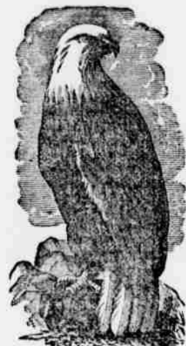
(Our old eagle is happy)

For 1880 let the order be to move all along the line and burn the bridges.