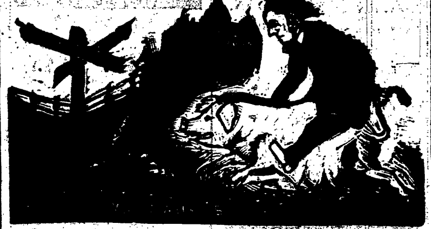
THE PRESIDENTIAL ELECTION—1898. SEYMOUR AT THE "CROSS ROADS."—OFFICIAL.

On Wednesday there was a general election of Democratic voters throughout the country.