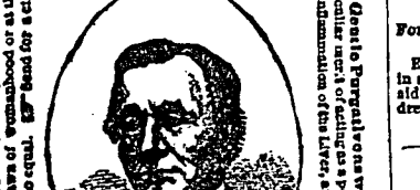
THEY ARE NOT A TITTLE FANCY DRINK.

ROAD LETTING.—The Supervisors of Bridge and Road will accept the house of A. B. Turrell, in North Bridge, on the 1st of October next.