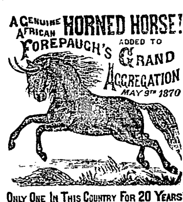
THIRTY MASSIVE DENS OF LIVING WILD ANIMALS!

Which is exhibited in a tent separate and distinct from the Animal show, and without extra charge, comprises the very best talent, selected without regard to expense, from the principal amphiteatres of Europe and America, consisting of twenty artists, including three clowns.