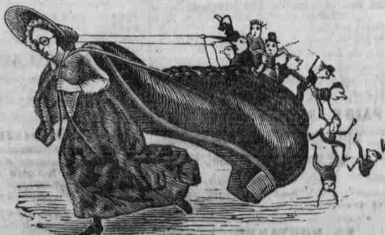
THE OLD WOMAN WHO LIVES IN THE SHOP.