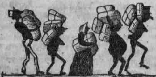
Sketched by our Artist in front of our Store.

Grief knits two hearts in closer bonds than happiness ever can; and common suffering is a far stronger link than common joy.