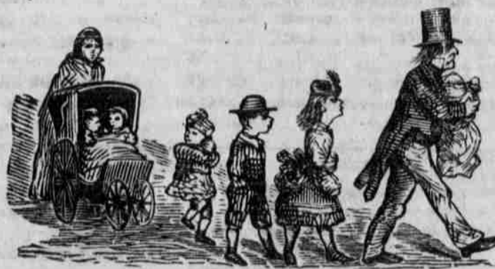
Come and see us. Come and stay all day. If you have nobody to leave the children with, bring them along. We are fond of children.

Our goods are all warranted as represented.