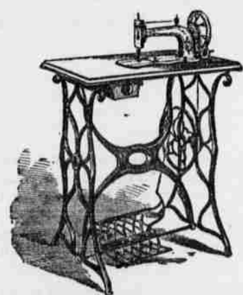
It is the Best and most desirable Family Sewing Machine now in use.

It makes the celebrated LOCK STITCH alike on both sides of the fabric.