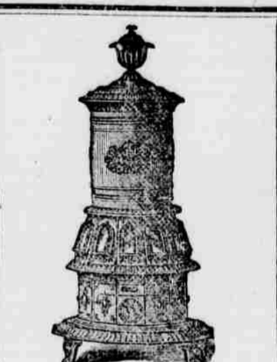
IMPROVED ORIENTAL! AND A GREAT VARIETY OF

TO THE WORKING CLASS. —We are now prepared to furnish all classes with constant employment at home, the whole of the three or four same moments. Business new, light and profitable. Persons of either sex easily earn from 50c. to $2 per evening, and a proportional sum by devoting their whole time to the business. Boys and girls can nearly as much as men. That all who see this notice may send their address, and test the business we make this unparalleled offer. To such as are not well satisfied, we will send $1 to pay for the trouble of writing. Full particulars, a valuable sample which will go to commence work on, and a copy of the People's Literary Companion —one of the largest and best family newspapers published—all sent free by mail. Further, if you want permanent profitable work address E. C. ALLEN & CO. —Augusta, Maine. nov15-18