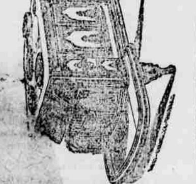
COGNAC AND HEATING STOVES At AMES'