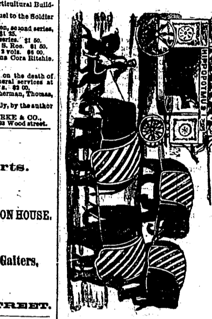
HOOP-KIRTS. HOPE'S PATENT...