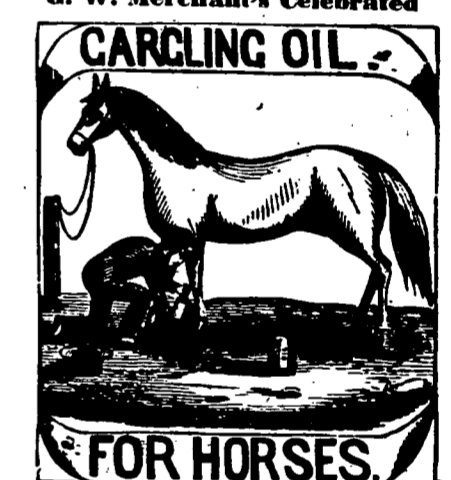
CARLING OIL FOR HORSES