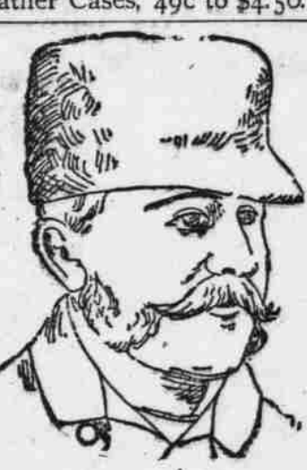
SEAL CAPS, In all qualities and shapes. $5 TO $12.

Superb line in Mahogany, Maple or Oak Wood, leather covered, Silver or Plush Cases, with fine satin linings, Also complete line of Solid Leather Cases, 49c to $4.50.