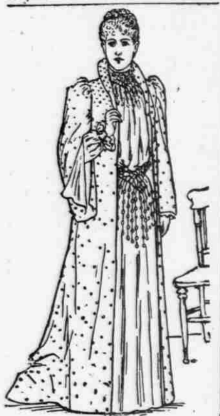
A Velvet Wrapper.

The illustration presents a charming gown, made up in garnet velvet with coral dots. The front is double, the outer ones in velvet hanging loose and having no cores, while the sides and back are fitted to the figure so as to make the train hang well. The Watteau fold starts from the neck. It is made of a breadth of the stuff tacked straight and let into the center seam at the back, which, for this purpose, must be opened for an inch or so below the waist