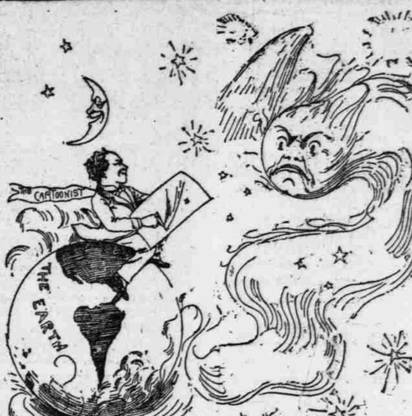
WHY THE COMET DID NOT STRIKE THE EARTH.

Do Wires Little Early Risers. Best pill for biliousness, sick headache, indigestion.