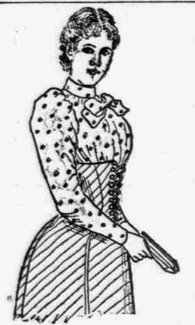
A Girl's School Dress.

In the illustration you'll find a very pretty silk and cloth combination costume for a young person. The color of the cloth is quite a matter of taste, while the blouse should be either in foulard or pongee.