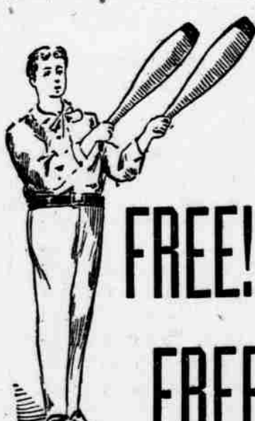
A PAIR OF INDIAN CLUBS

Your boy, if rigged out in one of these, will never freeze. $3.65 buys your pick from a lot of Boys' Fancy Cheviot Overcoats, warm and durable; sizes, 7 to 14; worth $6. $5 buys your pick from a line of regular $9 and $10 Extra Quality All-Wool Chincheilla and Heavy Scotch Plaid and Plain Cloth Ulsters; first-class in every respect.