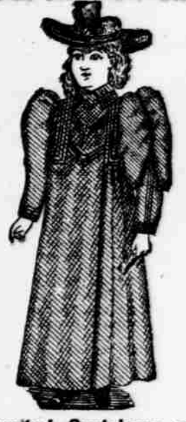
Imported Gretchens and Newmarkets.

AT $2.49—Dark, medium and light Gretchens or Newmarkets, with deep Military Cape; sizes 4 to 14; worth $4.50. AT $3.98—All-Wool Newmarkets or Gretchens, in tan, blue or brown mixtures; deep Military Cape; sizes 4 to 14; worth $6. AT $6.98—Misses' Newmarkets of Scotch mixed cloths; double breasted Military Cape or Watteau back; sizes 14 to 18; worth $11.