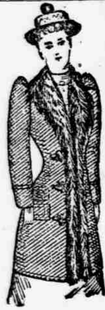
Cape Coats, Newmarkets, Etc.

AT $3.49—Fine French Lynx Fur Capes, 28 inches long; satin lined; worth $5. AT $6.98—Best Canadian Seal Capes, 18 inches long; satin lined; worth $14. AT $21—Finest Canadian Seal Military Capes, 30 inches long; with extra vest; lined with very fine satin; worth $35. 500 FINE MINK HEAD FUR SCARFS. $3.69 Regular prices elsewhere $6 and $7.