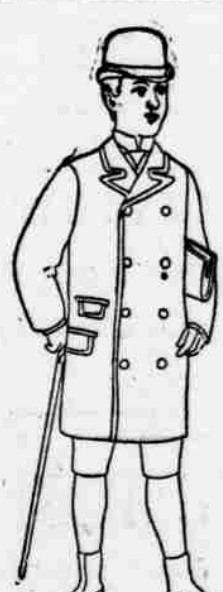
Boys' Double-Breasted Box Coats.

Certainly the most health promoting article for exercise, will be given free with every Boy's Suit or Overcoat. If you don't want the Indian Clubs take a set of those Brownie Ten Pins.