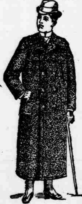
BOYS' STORM OVERCOATS.

$5 for choice from 16 different styles of Fine Scotch Cape Overcoats, neatly braided, fancy cape, fancy pockets, fancy cuff and collar; worth from $8 to $10. $7.50 for choice from a line of Boys' Extra Fine Scotch Homespun and Boule Fancy Cape Overcoats, jauntily trimmed in leather; worth from $12 to $14. $1.25 for choice from 600 pairs Young Men's Cassimere Pants, in stripes and checks; sizes, 14 to 19; worth $2.00.