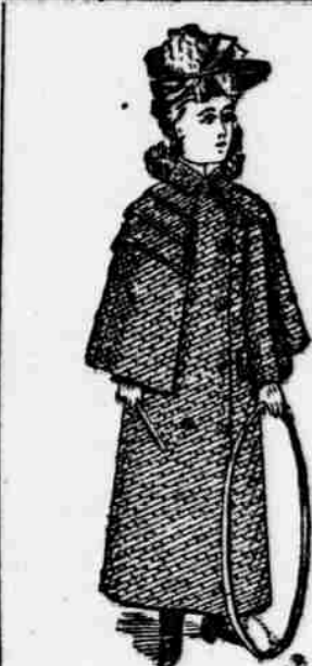
Imported Gretchens and Newmarkets.

AT $2.49—Dark, medium and light Gretchens or Newmarkets, with deep Military Cape; sizes 4 to 14; worth $4.50. AT $3.98—All-Wool Newmarkets or Gretchens, in tan, blue or brown mixtures; deep Military Cape; sizes 4 to 14; worth $6. AT $6.98—Misses' Newmarkets of Scotch mixed cloths; double breasted Military Cape or Watteau back; sizes 14 to 18; worth $11.