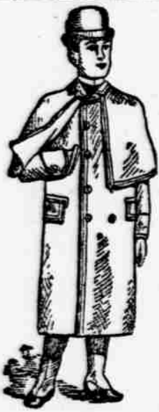
Boys' Cape Overcoats.

$1.49 for choice from 15 different styles of Boys' Long Cape Double-Breasted Overcoats, made of heavy plaids and checks; sizes, 4 to 14; worth from $3.00 to $4. $2.65 for choice from 27 different styles first-class Cassimere and Cheviot Double-Breasted Cape Overcoats, in dark and light patterns and colors; sizes, 4 to 14; worth from $4 to $5. 69c for choice from a lot of Fine All-Wool Cassimere or Cheviot Knee Pants, formerly $1.50 and $1.75.