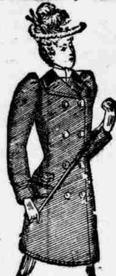
MISSES' FUR-TRIMMED JACKETS.

AT $12—Very fine Triple Cape Coats, in navy and black, 36 inches long; in favor and fashion all through the East; regular price $20. AT $10—Navy and black Military Cape Newmarkets, extra large size, with deep rolling collar; regular price $15. AT $5—Plain Cheviot Cloth Capes, with Watteau back; 42 inches long; easily worth $8. AT $10—Fine Diagonal or Cheviot Capes, 42 inches long, trimmed with ribbon, braid or embroidery; full value $15.