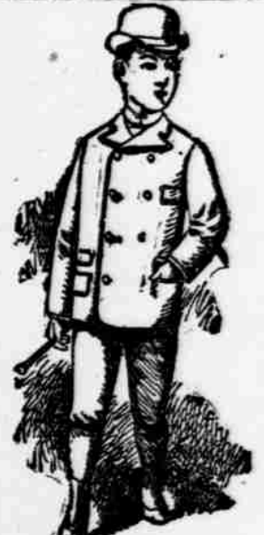
Boys' Double-Breasted Suits

$2.35—At this price we offer a fine lot of Fancy Reefers, made of All-Wool Chincheilla; prettily braided; brass buttons; sailor collar; worth from $4 to $4.50. $5—At this price we offer a very handsome line of very fine, heavy weight cloth and Jersey Coats, sizes 2 1/2 to 12; beautifully embroidered; full value $10. A lot of fine, fancy Kilt Overcoats, worth $5, at $2.95.