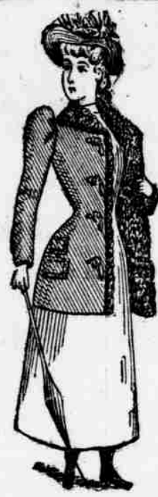
MISSES' PLAIN JACKETS.

AT $3.95—Tan, brown and grey, fine All-Wool Reversible Cloth Reefers, 32 inches long; well made; regular price $7. AT $4.75—Black and navy fine Cheviot Reefers, with square or notch collar, 32 inches long; box back; perfect fitting; well made; regular price $8.50. AT $7—Very fine All-Wool Invisible Cheviot Coats, silk binding; coat back; half silk lined; worth $12. AT $8.50—Fine Diagonal Box Coats, 34 inches long, with or without Watteau back; half silk lined; worth $14.