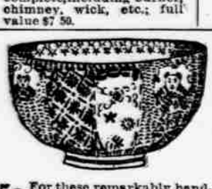
50 For these remarkably hand-some Japanese China Mush or Oyster Bowls; prettily decorated; full value 15c.