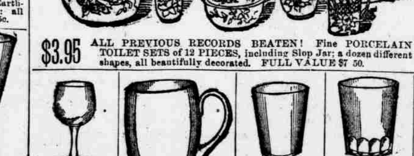
95c PER DOZEN 95c Per dozen. Extra Restra fine Thin Blown Lead Glass Punch or Sherbet Mugs; full value 75c. Extra fine Thin Blown Lead Gines Brandies: full value $1.75.